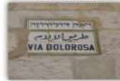
The Way of the Cross

THURSDAY, NOVEMBER 17, 2022 "The Triduum"